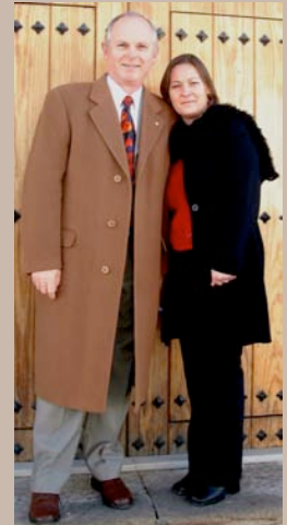
OUTSIDE THE CHURCH