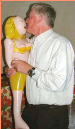
UNFORTUNATELY SHE HAD A FEW DRINKS AND WAS ALREADY BEING UNFAITHFUL TO HIM BY THE END OF THE EVENING!