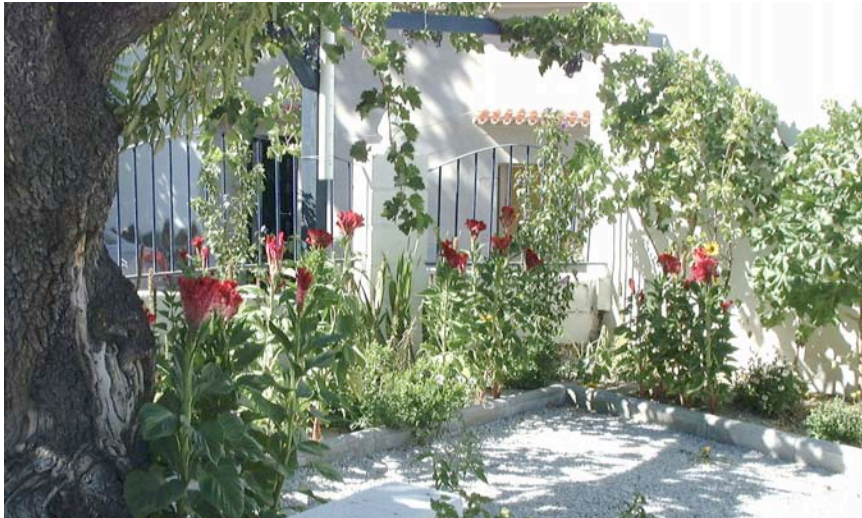
THE GAZEBO FOR DINING ON THOSE BALMY SUMMER EVENINGS..