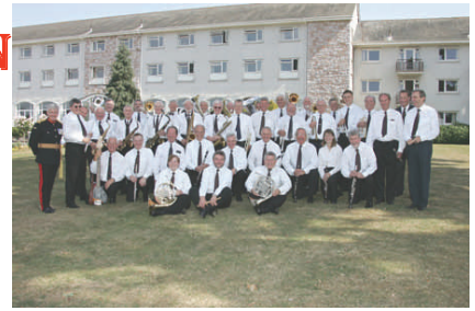
The Band at CTCRM